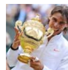
2010 ATP Champions