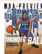
10.25.10 ▶ READ ALL ARTICLES