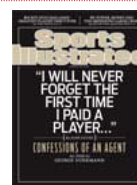
10.18.10 ▶ READ ALL ARTICLES ▶ BUY COVER REPRINT